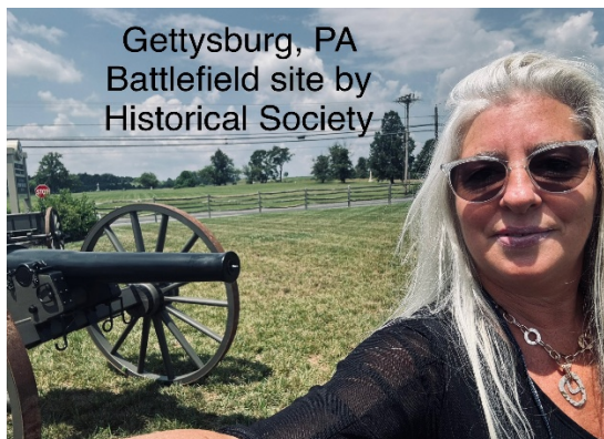
Gettysburg, PA Battlefield site by Historical Society

The first photo is of me standing outside the Adams County Historical Society. This is where we had our Teacher Symposium. Right outside was a large portion of battlefield that has been preserved. The cannon is a replica that fires.