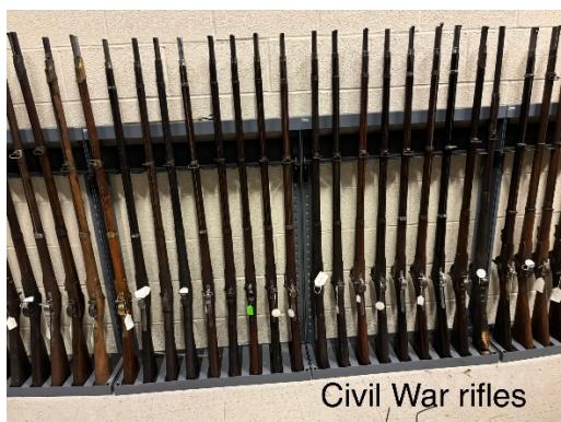
Civil War rifles

The second photo is a booklet from West Point Academy where Class of 1846 Cadet (and future Confederate General), George Pickett, received a list of articles he was to receive. This book was viewed as we toured the Archive Room at the National Civil War Museum in Harrisburg, PA.